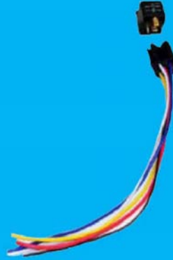
Relay & Socket